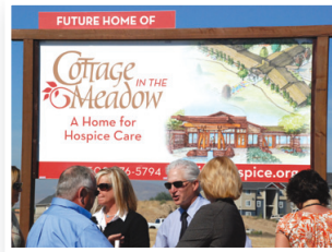
September 18, 2009, a public gathering blessed the property of Cottage in the Meadow, A Home for Hospice Care.

To date, The Memorial Foundation has raised $6,673,016 for the capital campaigns: